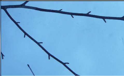
Alternate buds Buds or leaf scars face each other.