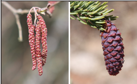
Twig with seed or fruit These could be hanging catkins, nuts, or seed cones.