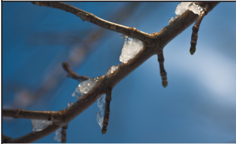
Opposite buds Buds or leaf scars do not face each other.