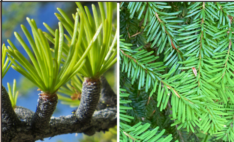
Twig with needles Needle may be bunched or single, running down the stem.