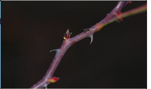
Twig with thorns Pointy thorns grow along the twig.