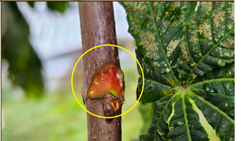
Leaf scar A scar left on the twig where the leaf fell off.