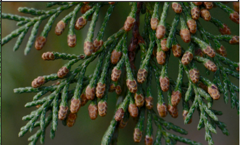
Twig with scales Twigs with overlapping scales.