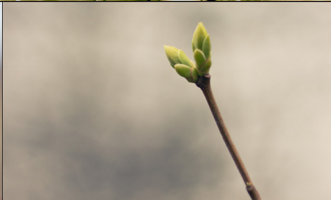
Bud scales Small scale-like structures that are modified leaves covering the bud during winter.